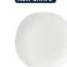
Organic Round Plate WHISO101 26.4cm 10 1/2" CTN QTY 12