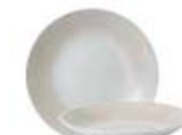
Deep Coupe Plate o ANISID271 28.1cm 11" H: 3.7cm CTN QTY 12