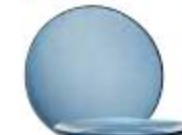
Organic Glass Plate GLBLOP291 29.5cm 11 1/2" CTN QTY 6