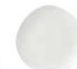
Organic Round Plate WHISO111 28.6cm 11 1/2" CTN QTY 12