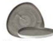
Chefs' Triangle Walled Plate SPGWT271 26cm 10 1/4" H: 2cm CTN QTY 6