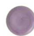
Coupe Plate o SLASEVP81 21.7cm 8 1/2" CTN QTY 12