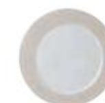
Presentation Plate o ANISIP121 30.5cm 12" CTN QTY 12