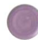
Coupe Plate o SLASEV101 26cm 10 1/4" CTN QTY 12