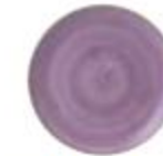
Coupe Plate o SLASEV111 28.8cm 11 1/2" CTN QTY 12