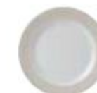
Footed Plate o ANISIF581 27.6cm 10 1/4" CTN QTY 12