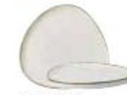
Chefs' Triangle Walled Plate SWHWT271 26cm 10 1/4" H: 2cm CTN QTY 6